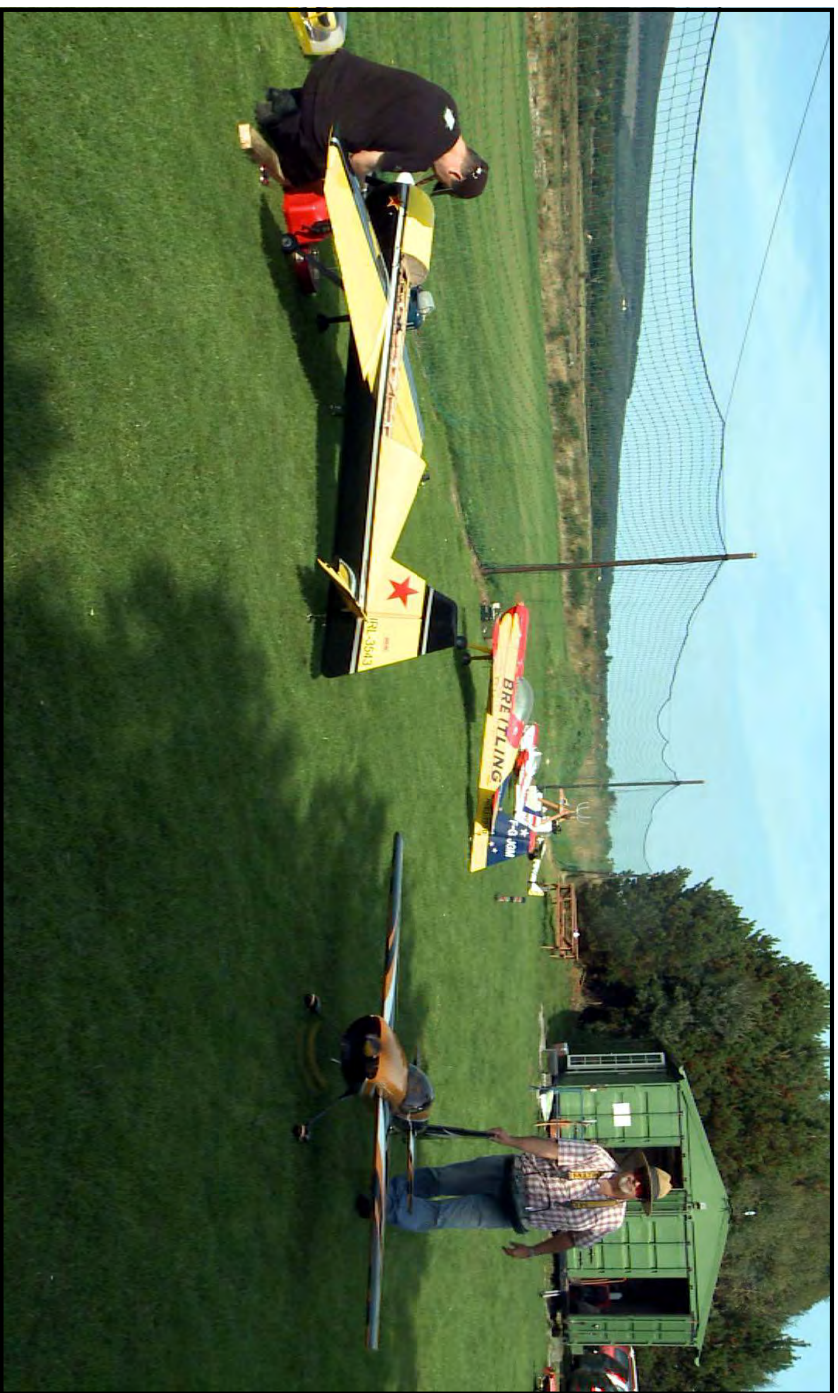
The Pits Area at Roundwood