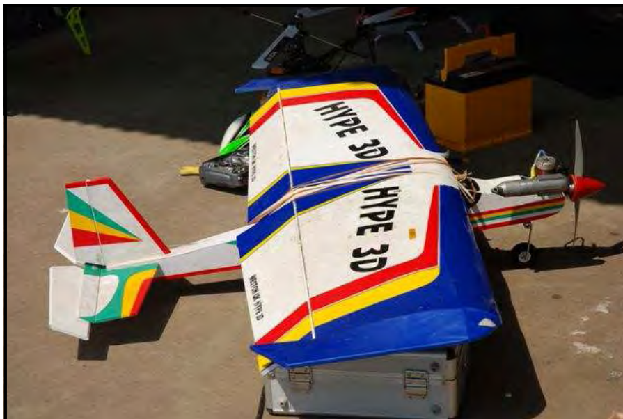
Donals Jumper 25 Hype 3D Midland MFC Fun-Fly 2013