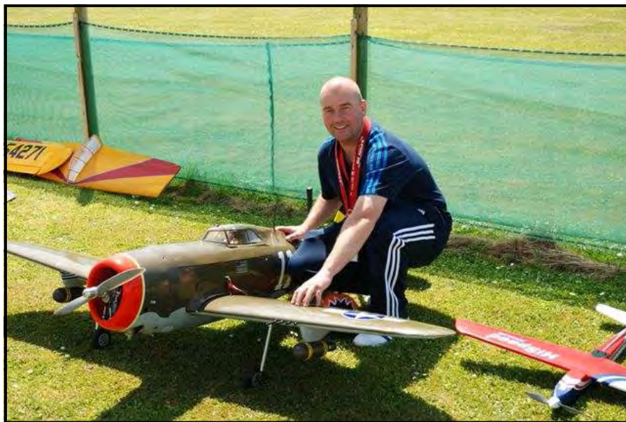
Another shot from the Midland MFC Fun-Fly 2013