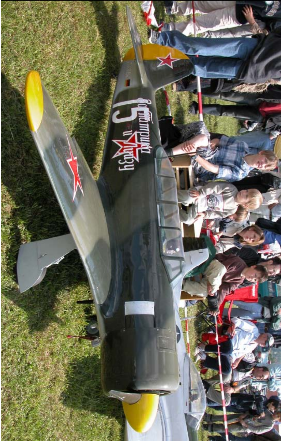
One of the Larger Models at I.G. Warbird