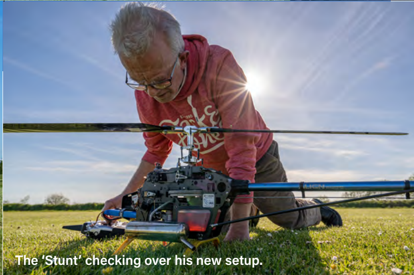
The 'Stunt' checking over his new setup.