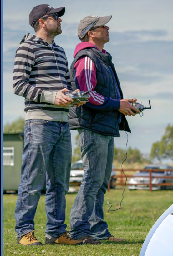
Buddies on the 'box'.